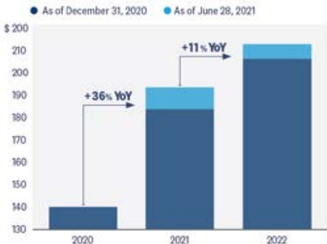
8 RISING EARNINGS EXPECTATIONS SET UP A STRONG RAMP UP IN 2021 Consensus S&P 500 Index Earnings Per Share (EPS) Estimates:

Economic forecasts may not develop as predicted.