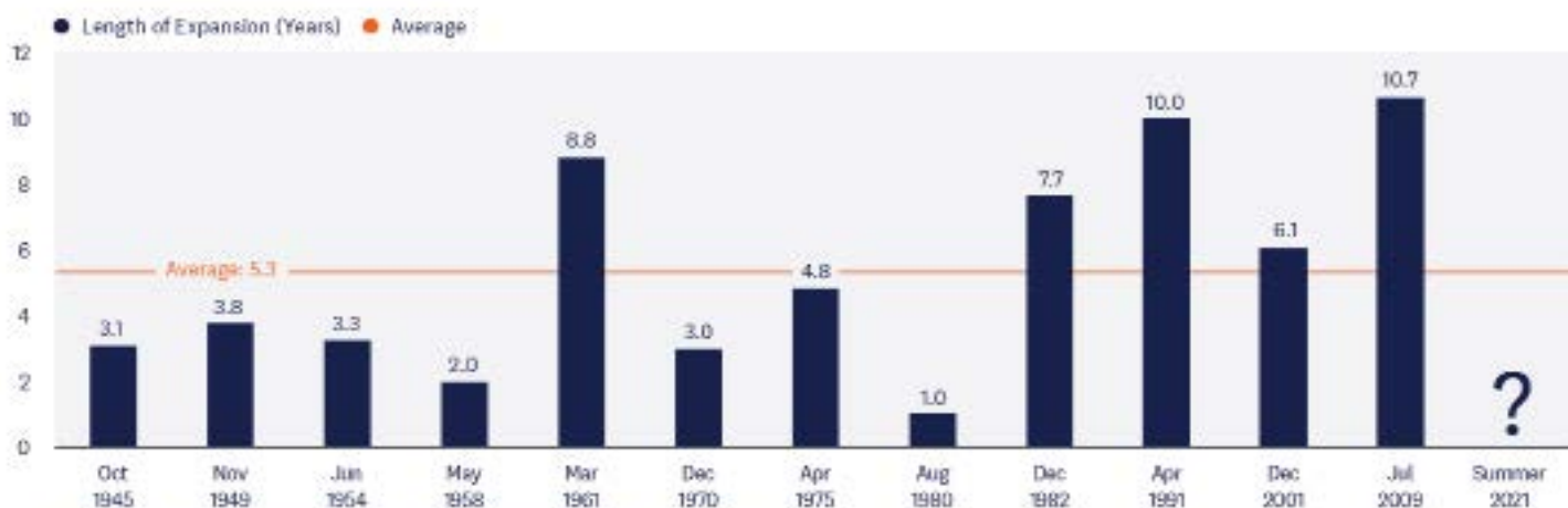
2 NEW ECONOMIC EXPANSION COULD LAST YEARS This New Expansion Could Have Years Left

Source: LPL Research, National Bureau of Economic Research (NBER) 06/28/21