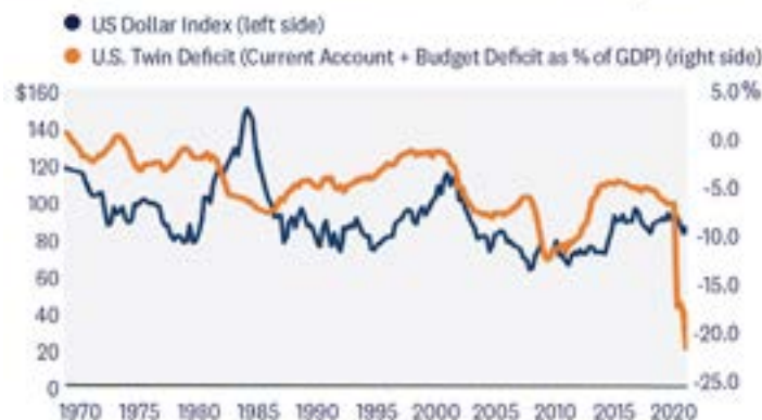
3 TWIN DEFICITS CREATE STRUCTURAL PRESSURE ON THE U.S. DOLLAR Huge Deficits Could Pressure The U.S. Dollar Lower For Many More Years