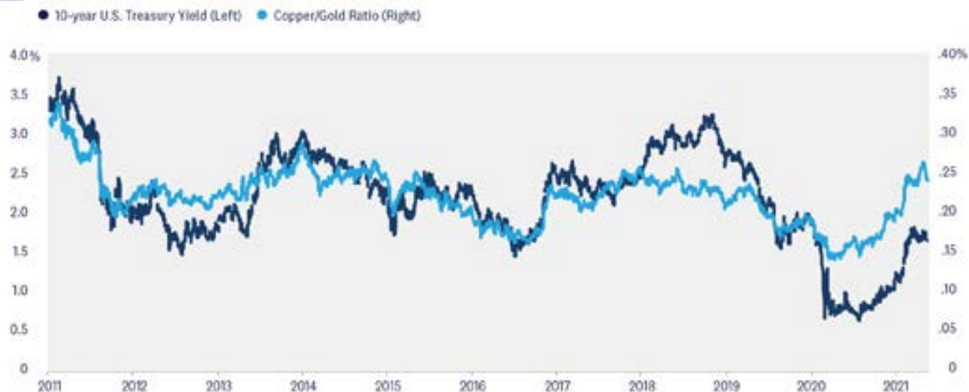
9 HIGH COPPER TO GOLD PRICES IMPLY 10-YEAR TREASURY YIELDS SHOULD BE HIGHER

All indexes are unmanaged and cannot be invested into directly. Past performance is no guarantee of future results.